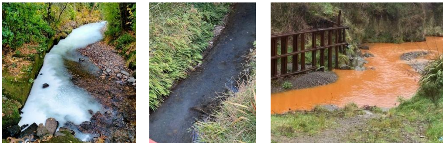
Examples of pollution in the streams flowing through Glenside 2024-2025

The Assn. is keeping a record of water contamination incidents raised by the community and is discussing Greater Wellington response at our meetings. In August 2024, as a result of a resident inquiring what action had been taken after they complained about the stream turning black, Greater Wellington advised that they had issued a $750 infringement notice to McMud in Grenada, for water contamination in Porirua stream.